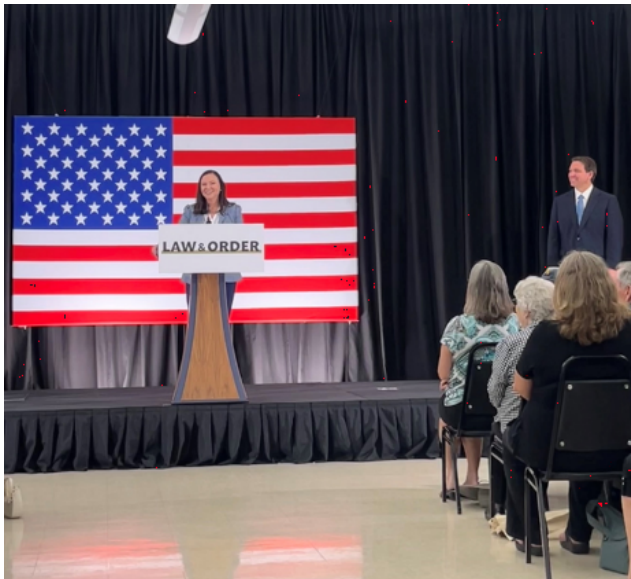
Attorney General Moody leading the FL-18 Human Trafficking Roundtable at Polk County Sheriff's Office.