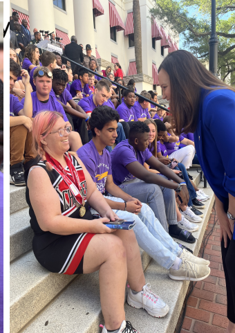
Law Enforcement Torch