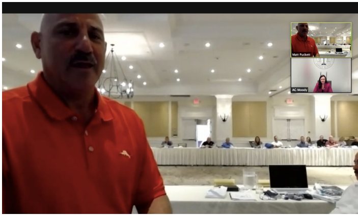
Attorney General Moody virtually addressing members of Florida TaxWatch during the organization's 41st Annual Meeting.