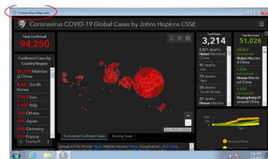
Figure 1. Screenshot of the malicious website "Corona-Virus-Map[dot]com" pretending to be a legitimate COVID-19 tracker.

This week, I issued a Consumer Alert to warn Floridians about scams related to the COVID-19 pandemic.