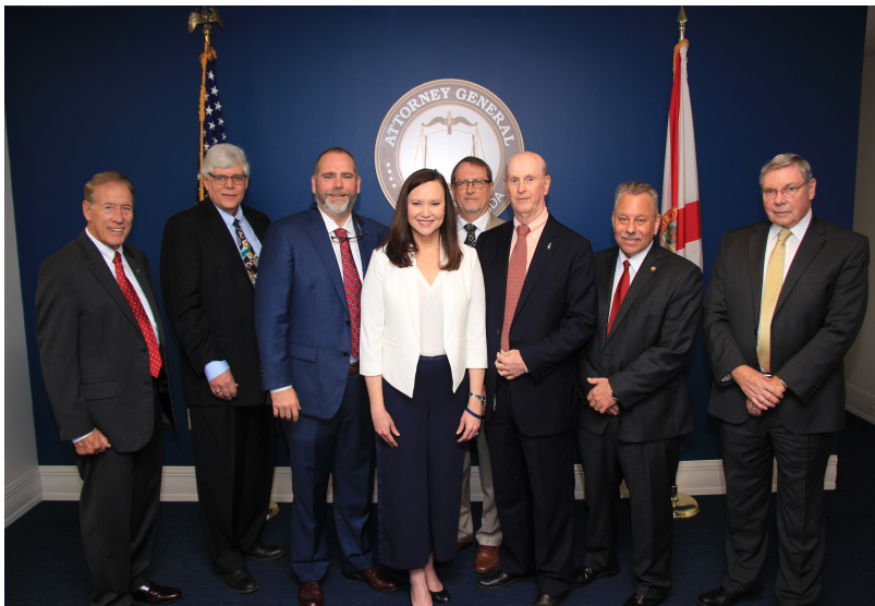
Attorney General Moody speaking to leaders of the Florida Tax Collectors Association in Tallahassee about her 2020 legislative priorities.