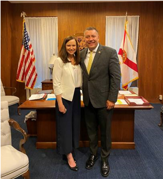
Attorney General Moody meeting with University of South Florida students involved in the Tallahassee Internship Program during Legislative session.