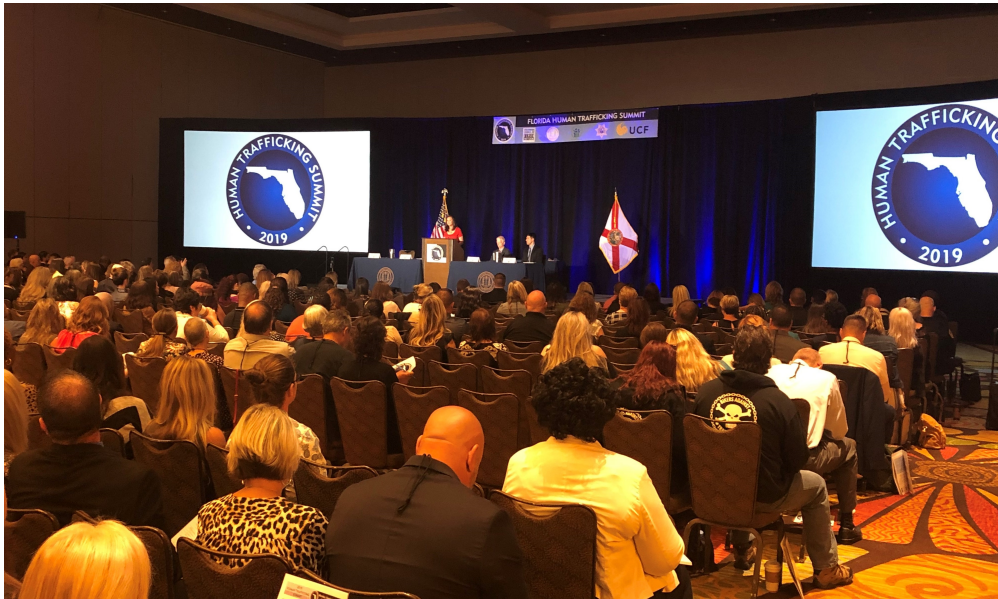
PHOTO RELEASE: Attorney General Hosts 2019 Human Trafficking Summit

Attorney General Ashley Moody kicked off the 2019 Annual Human Trafficking Summit in Orlando. Florida's Human Trafficking Summit brings together local, state and national leaders working together to eradicate all forms of trafficking. Attendees participated in targeted breakout sessions covering legal/law enforcement, service delivery, policy and research, and medical/healthcare. Attorney General Moody gave opening remarks to more than 850 registered attendees, including welcoming Governor Ron DeSantis to the Summit.