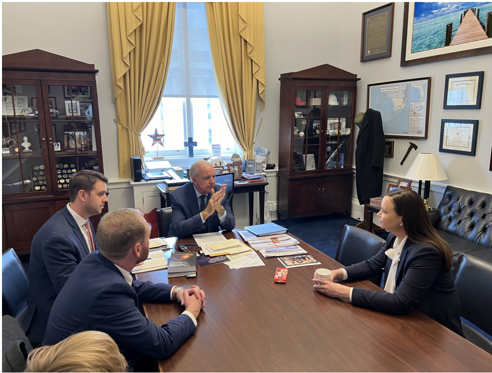
Attorney General Moody alongside Rep. Chip Roy of Texas in the representative's U.S. Capitol office.