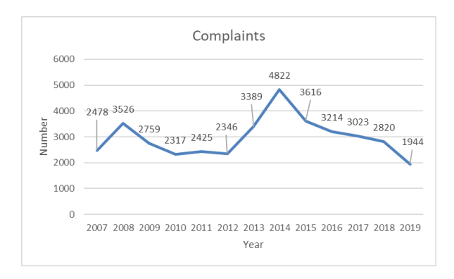
Figure 2 Complaints