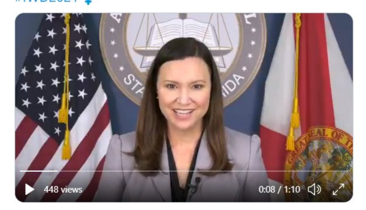
9:19 AM \cdot Mar 8, 2021 \cdot Twitter Web App

Today is #InternationalWomensDay Q , a day to celebrate women's achievements throughout history by recognizing the social, economic and political advancements we continue to make worldwide.